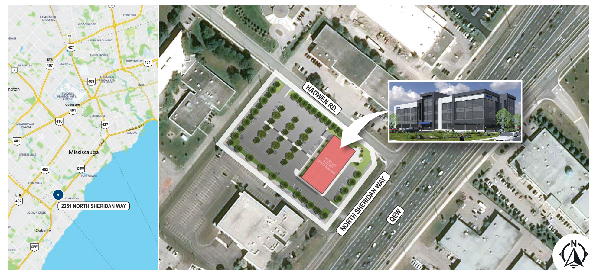
2251 NORTH SHERIDAN WAY is located west of Erin Mills Pkwy just north of the QEW